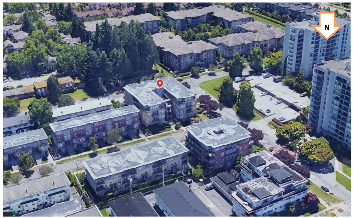
Figure 2: Aerial image of 5692 Kings Road, Area D (starred).