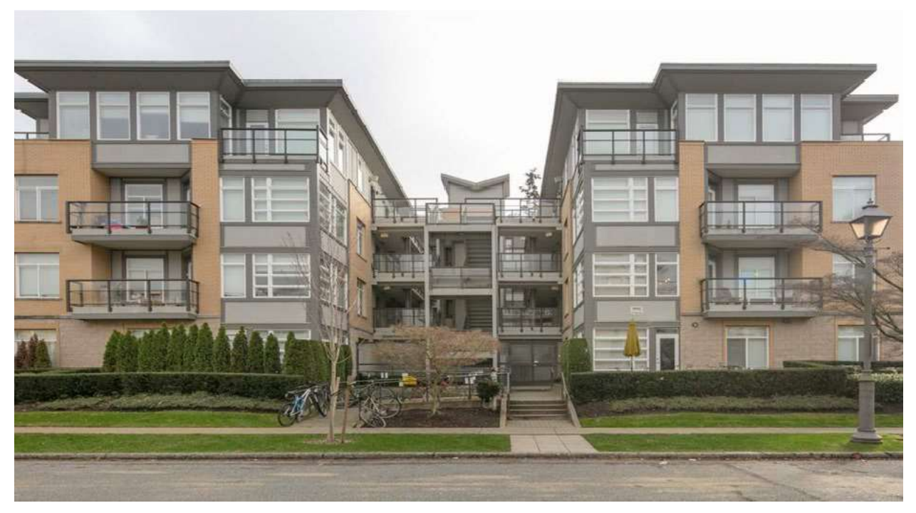
Figure 3: Existing Street view looking south of 5692 Kings Road, Area D.